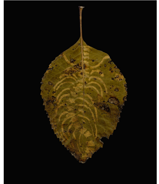
Curvature Villainization, 2019 By Megan Bent