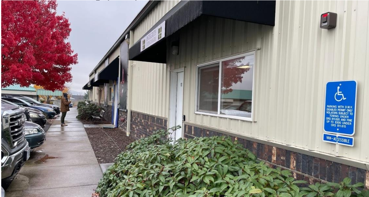
Image: An accessible parking sign on the business front one business to the right of Ashland Aerial Arts (Dr Bari Hartley). There is no curb from the parking lot to the sidewalk.

Images: Three photos of the outside of the studio and the parking lot. 1. The sign on the right side of the road for Building B where Ashland Aerial Arts resides. There are several other signs for businesses that share the same building. 2. The business front for Ashland Aerial Arts. 3. The sidewalk and parking lot with no gap or lip between. It is a flat surface with no barriers.