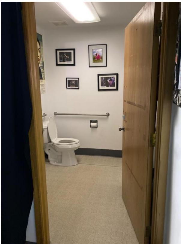
Image: A wooden door opening into a room with a toilet and a horizontal grab bar.

On the right side of the entrance way, there is a single gender-neutral bathroom has a 32.5-inch door that opens inward. The door handle is a round, twist knob. It has a deadbolt with a “vacant/occupied” indicator. The bathroom has a wall mounted mirror (that goes to sink level and is visible from lower heights) and sink (with space below for wheelchair users), with a moveable step stool, toilet with two horizontal grab bars and a storage cabinet. There is 49.5 by 60 inches of free space in the room, with 33 inches between the toilet and cabinet at its narrowest point. Unscented soap is used in the bathroom. A basic first aid kit and sanitary supplies are on the supply cabinet. There is no changing table in the space.