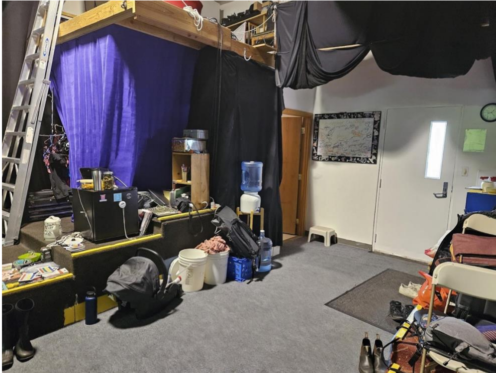
Image: Interior entrance space with carpeted floor, risers with stim and other access items as well as a mini refrigerator, a water dispenser, towels for cleaning, and a lower sensory space behind a purple curtain (up a few stairs)