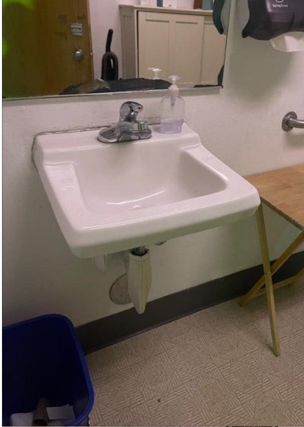
Image: The bathroom mirror, wall mounted sink and moveable stool, small folding table, toilet with grab bars behind and to the left.