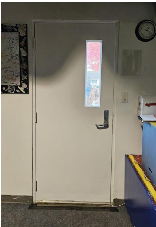
Image: Main entrance door from the inside.