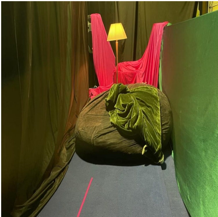
Image: Soft bean bag chair with blankets.