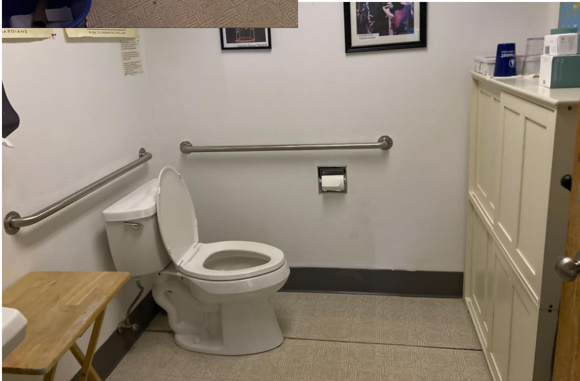
Image: Bathroom angle showing the toilet with two grab bars, folding table and the storage cabinet opposite the toilet.