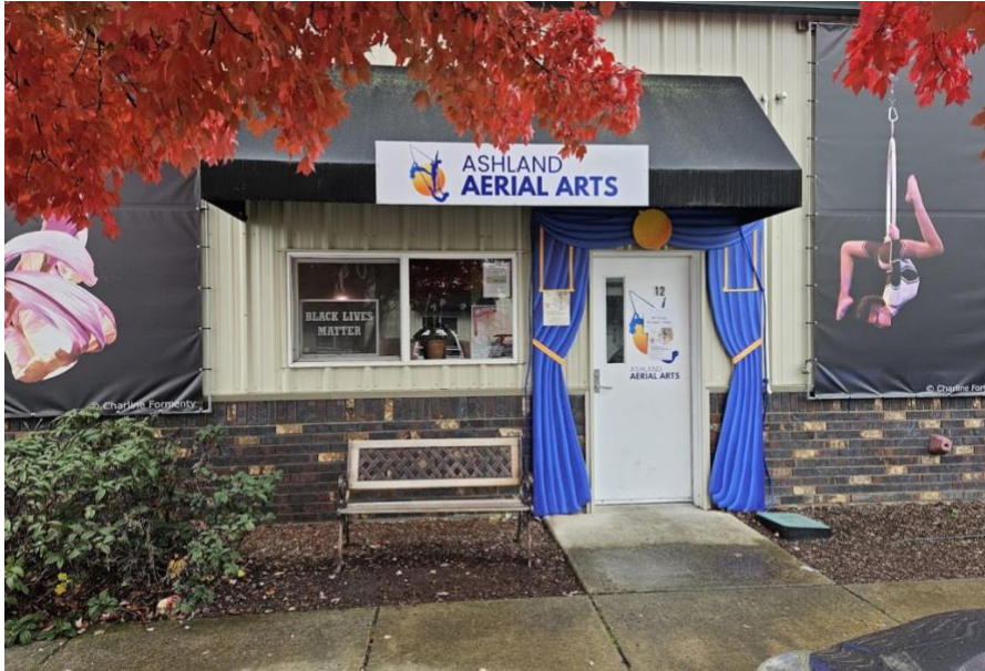
Image: Main entrance from the outside with the door, window, sidewalk and bench.