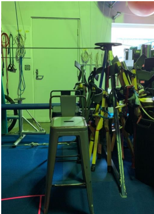
Image: Emergency exit door with tight rope crossing entryway. Right side of door is blocked with stilts.