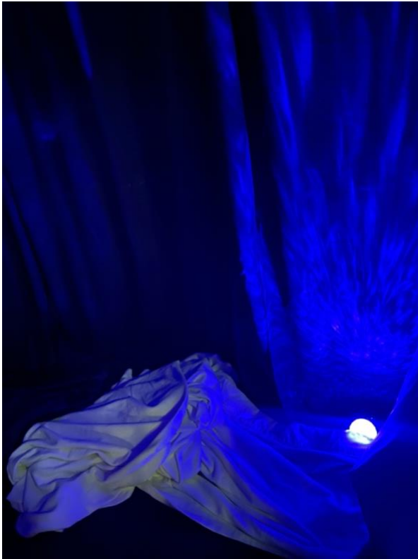
Image: A galaxy light and blankets inside a lower sensory space.